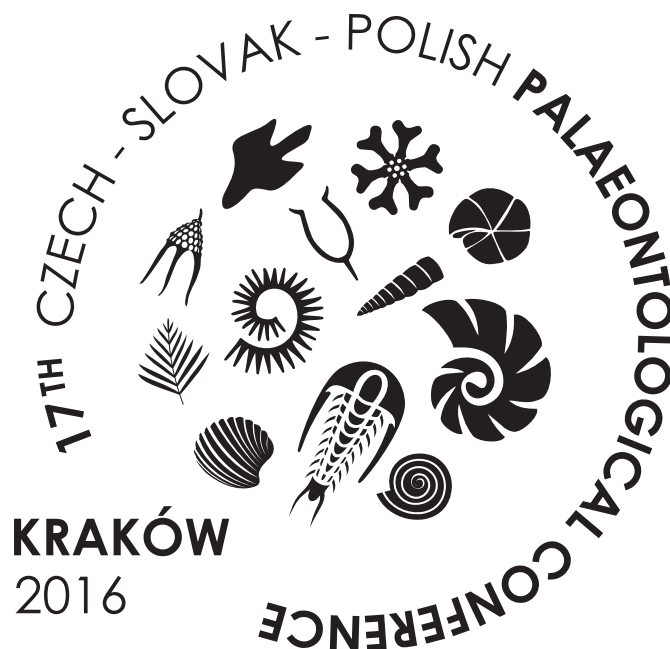
Official logo of the conference

As a cartographer and a student teacher at the Jagiellonian University he paid close attention to the usefulness of palaeontological data for determining age and conditions of the formation of the Carpathian rocks (Bathymetry of the Carpathian Flysch Basin, 1975; Trace Fossils of the Polish Carpathians, 1977). His activities led to creation of the post-war Polish Geological School. The interdisciplinary studies initiated by him in the Carpathian Branch are carried out under geological mapping today. In 2016 is 110 th anniversary of his birth (1906-1981).