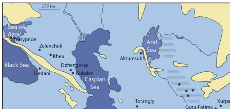
Figure 1 Paleogeographic map showing localities of studied sections that contain the sapropel bed (SB) related to PETM. Blue – Peri-Tethyan basin, yellow – land, dashed area delineates a realm of occurrence of oil-shale coeval to SB.

The cyclic nature of the SB is best defined in sections that contain a high TOC content (e.g. not less than 5%). In sections where TOC is lower (e.g. 2–3%), the variations in TOC content are of a lower magnitude and cyclicity is poorly defined. Only one cycle is present in